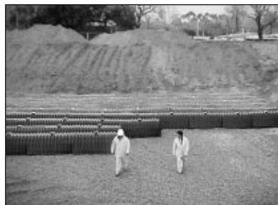
Field infiltrators being installed at Broadous School.