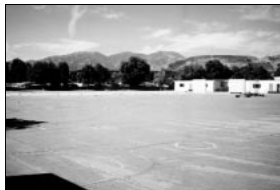
Before: Broadous School was a sea of asphalt.

The Sun Valley program is part of a watershed “makeover plan” for the greater Los Angeles basin. This plan would convert Los Angeles from a concrete jungle, whose infamous channelized “river” is the most glaring symptom of its watershed-wasting disease, to a greener place that responds to natural events in more sustainable patterns. In 1997, TreePeople brought together dozens of urban planners, landscape architects, engineers, urban foresters and public agencies to devise “best management practices” and a plan of action for the Los