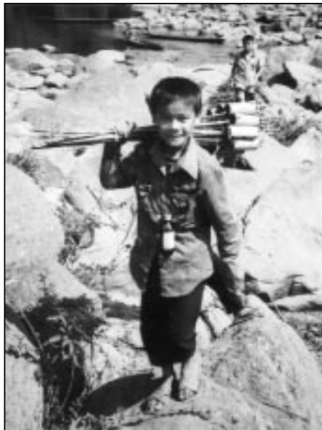
Dams in Laos have reduced fisheries, forcing families to rely more on hunting. These boys are trying to catch rats to eat.

The project, which is expected to be completed by December 2004, involves the construction of a 22-meter-high dam and 10-square-kilometer reservoir on the Nam Nyang River. Water from the reservoir will pass through a 40-MW powerhouse before being discharged into the nearby Nam Ngam River. The power is expected to be used both domestically and exported to Thailand. Nam