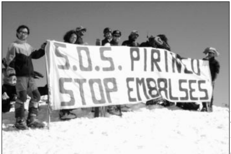
Spanish dam fighters shout from the mountain tops, "Stop Dams!"

One of the more creative events came from a strongly anti-dam region in Spain, where activists climbed the highest peak in the Western Pyrenees to be near the headwaters of the Aragon River. At the top of Collarada Peak they displayed a banner reading: SOS Pirineos (SOS Pyrenees), Stop Embalses (Stop Dams) to protest a highly controversial national water plan, which calls for the diversion of the Ebro River (which the Aragon flows into) and multiple dams. The action was organized by the Aragon River Association Against the Raising of the Yesa Dam, which is part of the Spanish dam-fighting coalition COAGRET. The action stressed that the integrity of rivers is vital, from a river's birth at the headwaters,